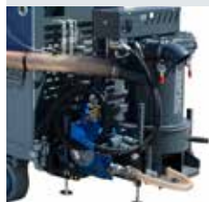
[ 1 ] VACUUM-WET 500