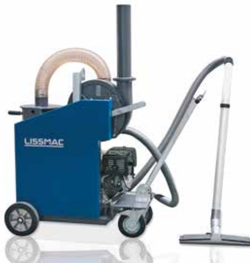
VACUUM-WET 100 P