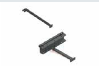
[ 2 ] Adapter kit for MULTICUT 905