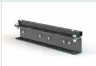
[ 3 ] Adapter kit for UNICUT 520/600