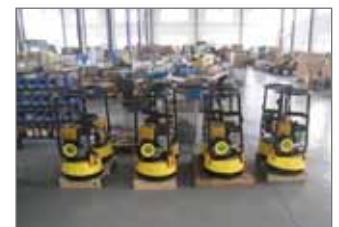
Mounted in large series