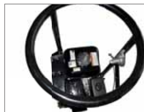
Centrally placed throttle