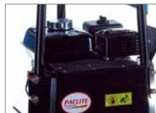
Extended safety cover