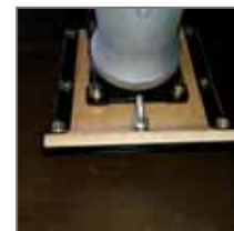
Heat laminated hand-made wooden foot

* Minimum vibration levels measured to EN500-4 Certified power SAE J 1349