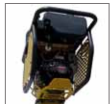
HONDA GX100 or GXR120