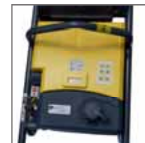
Engine shut-down on handle